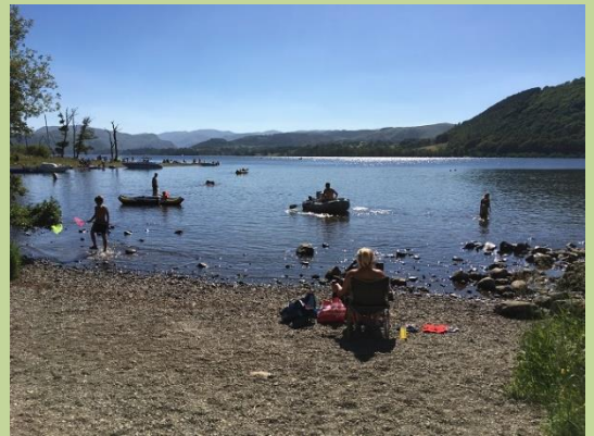
Pooley Bridge lakeside

Buses stop in the village centre and at the Ullswater Steamers pier which is approx 0.3 miles from the village centre.