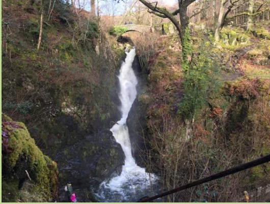
Aira Force waterfall

Aira Force is probably the most famous waterfall in the Lake District and at 65ft high, one of the tallest. From the car park there are various trails leading up through attractive woodland to the waterfall viewing areas and beyond. The views from the bridges at the top and bottom of the main waterfall are impressive, especially after heavy rain. The main waterfall walk is about 1 mile return with some steep and uneven sections. It is also well known for red squirrels and you might see one in the woods if you are lucky.