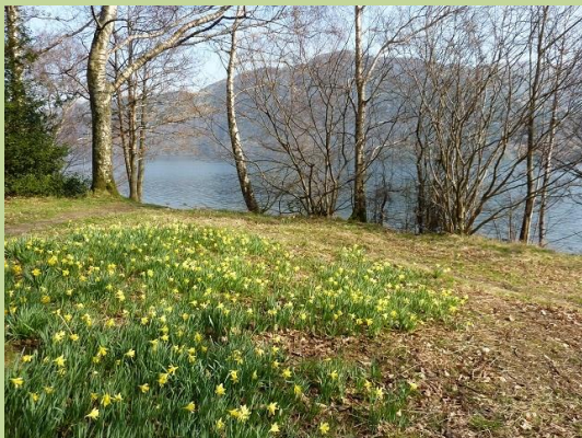
Daffodils at Glencoyne

Glencoyne Bay provides a scenic lakeshore area with narrow shingle beaches next to the road and wonderful views across the lake. You can follow the good footpath in either direction adjacent to the road if you want to explore nearby shoreline. Behind the car park, the wonderful Glencoyne valley heads inland from the lake and you can explore it on foot on the Glencoyne Farm trail . There are no facilities on site. Buses stop at Glencoyne car park.