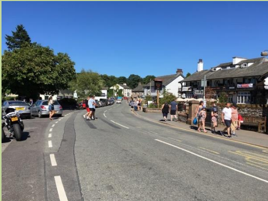
Pooley Bridge village

Pooley Bridge is a busy tourist village located at the northern end of Ullswater lake. There are a few shops, pubs and cafes although there isn't much else to see in the village itself. The area is popular with campers and caravaners who come from the many nearby sites. There are some good walks in the area but the main attraction are the Ullswater Steamers which can be caught from the nearby pier. Regular boats travel up the magnificent lake with various stops along the way. The historic road bridge over the River Eamont was famously destroyed in December 2015 by storm Desmond, the new bridge was opened in 2020. Public toilets in the village.