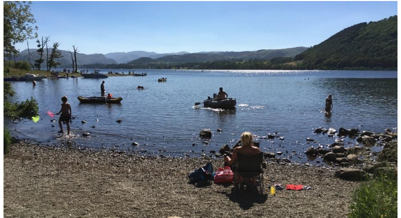
Ullswater from Pooley Bridge lakeside