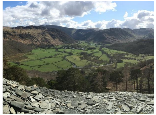
Borrowdale from Castle Crag

Take the Honister Rambler 77A bus from Grange in Borrowdale village to Gatesgarth Farm, passing through the magnificent Borrowdale valley, then up and over the mighty Honister Pass. From Grange, the bus soon passes the Bowder Stone on the left and through the 'Jaws of Borrowdale' where the wooded valley becomes very narrow alongside the crystal-clear River Derwent with Castle Crag above on the right. The valley soon opens out again as you leave the trees behind and you pass through Rosthwaite village . Continue to admire the wonderful scenery and surrounding mountains, passing Stonethwaite village and Seatoller village , where you can alight to explore nearby Seathwaite valley . The bus then ascends steeply up the notorious Honister Pass, possibly the steepest road on any Lake District bus route and you might be glad you aren't driving! The summit of Honister Pass is at 356m altitude and there are good surrounding views plus the historic Honister slate mine which still produces some slate and has various exciting adventure experiences on offer. The bus then descends quite steeply at first before following the attractive Gatesgarthdale valley. You can alight at Gatesgarth Farm to start a walk along the shore of Buttermere lake to Buttermere village.