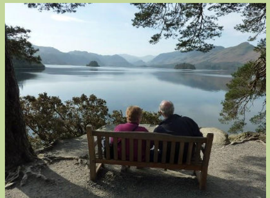
Derwent Water from Friar's Crag

A 10 minute walk from the town centre is the lakeside area on Derwent Water which is always popular and you can explore the lake either by boat or the fabulous 10 mile footpath which circuits the lake. The Keswick Launch cruise is a wonderful way to take in the lake and its surroundings. There are regular boats (less in winter) which stop here and at several beauty spots around the lake. It is definitely worth walking the short distance to Friar's Crag which offers beautiful views up the lake. Crow Park, opposite Lakeside car park, has a lovely open setting next to the lake where you can watch the boats come and go, again with great views. Between Crow Park and the town centre is Hope Park which has delightful landscaped grounds and miniature golf. There is a cafe, toilet facilities and the popular Theatre by the Lake which has its own facilities.