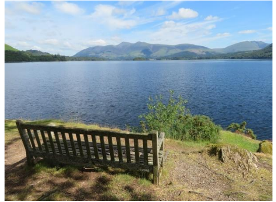
Myrtle Bay bench

A lovely short and level walk from High Brandelhow jetty to the village of Grange in Borrowdale. A well-worn footpath initially follows the shingle shore and then takes the left fork towards 'Lodore' opposite a cottage. Follow the wooded lakeshore through Manesty Park, passing picturesque bays with wonderful views down the lake. Myrtle Bay is one of them. Near the southern tip of the lake, beyond a couple of boardwalk sections, turn right on a less distinctive path through rough grassland and bracken towards Grange. There are superb surrounding views including the 'Jaws of Borrowdale' and Castle Crag. After approx 0.5 miles, reach a minor road and turn left along the road. In another 0.5 miles reach the village of Grange.