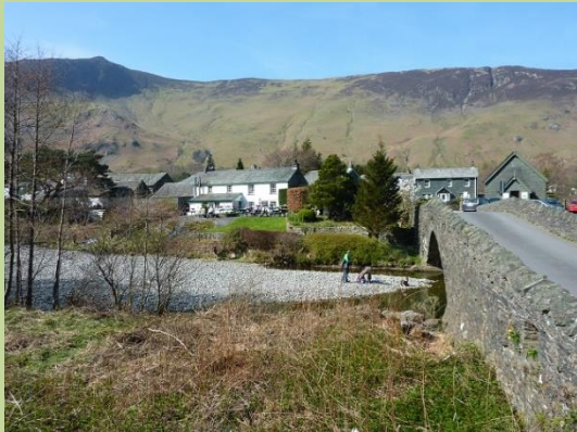
Grange in Borrowdale

Grange in Borrowdale is a small attractive village in a fabulous setting in the Borrowdale valley. It is worth a wonder through the timeless village with its pretty slate and whitewashed old houses. There is a cafe in the centre of the village and Holy Trinity Church which dates from 1861 and has some interesting 'dog-tooth' ceiling decoration. Next to the bridge is the Methodist Church which dates from 1893 and now houses ' The Borrowdale Story ' display, telling the interesting history of the valley. There are public toilets by the river.