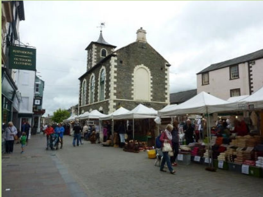
Keswick town centre

Keswick is a popular and pretty tourist town nestled between Derwent Water and Skiddaw mountain. It has long been the main hub for the northern Lake District and boomed when the railway line from Penrith and west Cumbria was completed in 1864, bringing Victorian tourists to Keswick station. You can still see the station today in the northern town but the railway line was closed in 1972. The old railway line is now a popular cycle and walking path alongside the River Greta towards Threlkeld to the east.