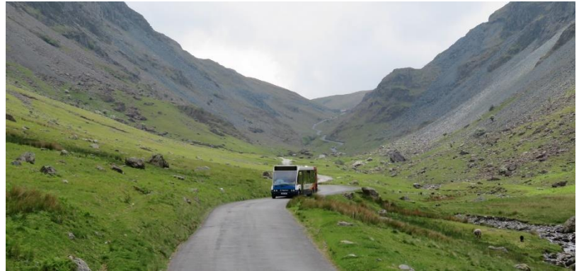
Honister Pass from Gatesgarthdale