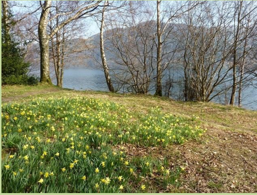
Daffodils at Glencoyne

Glencoyne bay provides a scenic lakeshore area with narrow shingle beaches next to the road and wonderful views across the lake. You can follow the good footpath in either direction adjacent to the road if you want to explore nearby shoreline. Behind the car park, the wonderful Glencoyne valley heads inland from the lake and you can explore it on foot on the Glencoyne Farm trail . There are no facilities on site. Buses stop at Glencoyne car park.