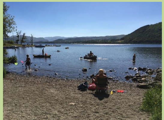
Pooley Bridge lakeside

Buses stop in the village centre and at the Ullswater Steamers pier which is approx 0.3 miles from the village centre.